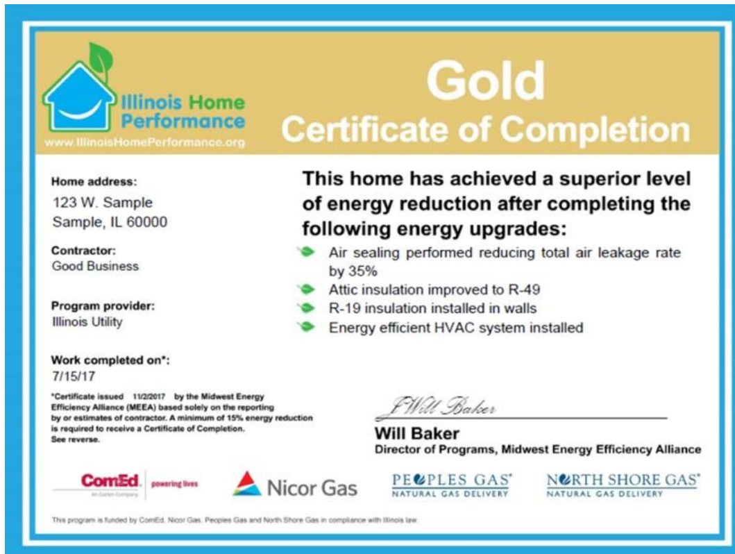
Exhibit 5 Sample Certificates for Existing Homes with Energy and/or Green Retrofits